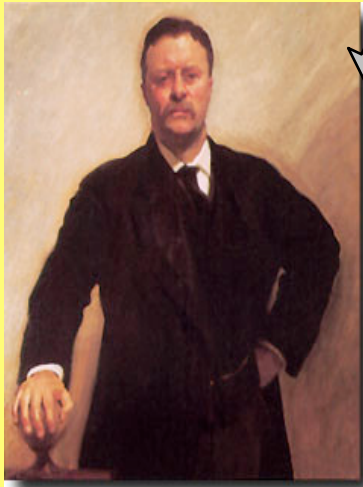
Theodore Roosevelt's "Square Deal"